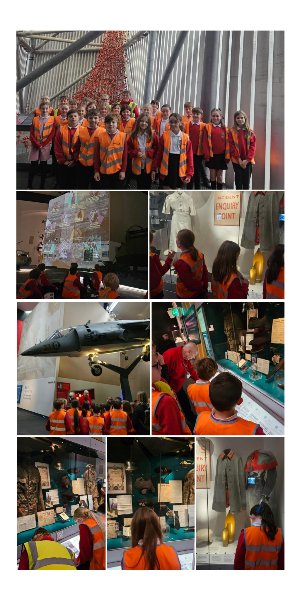
Follow us on Facebook at The Calder Learning Trust