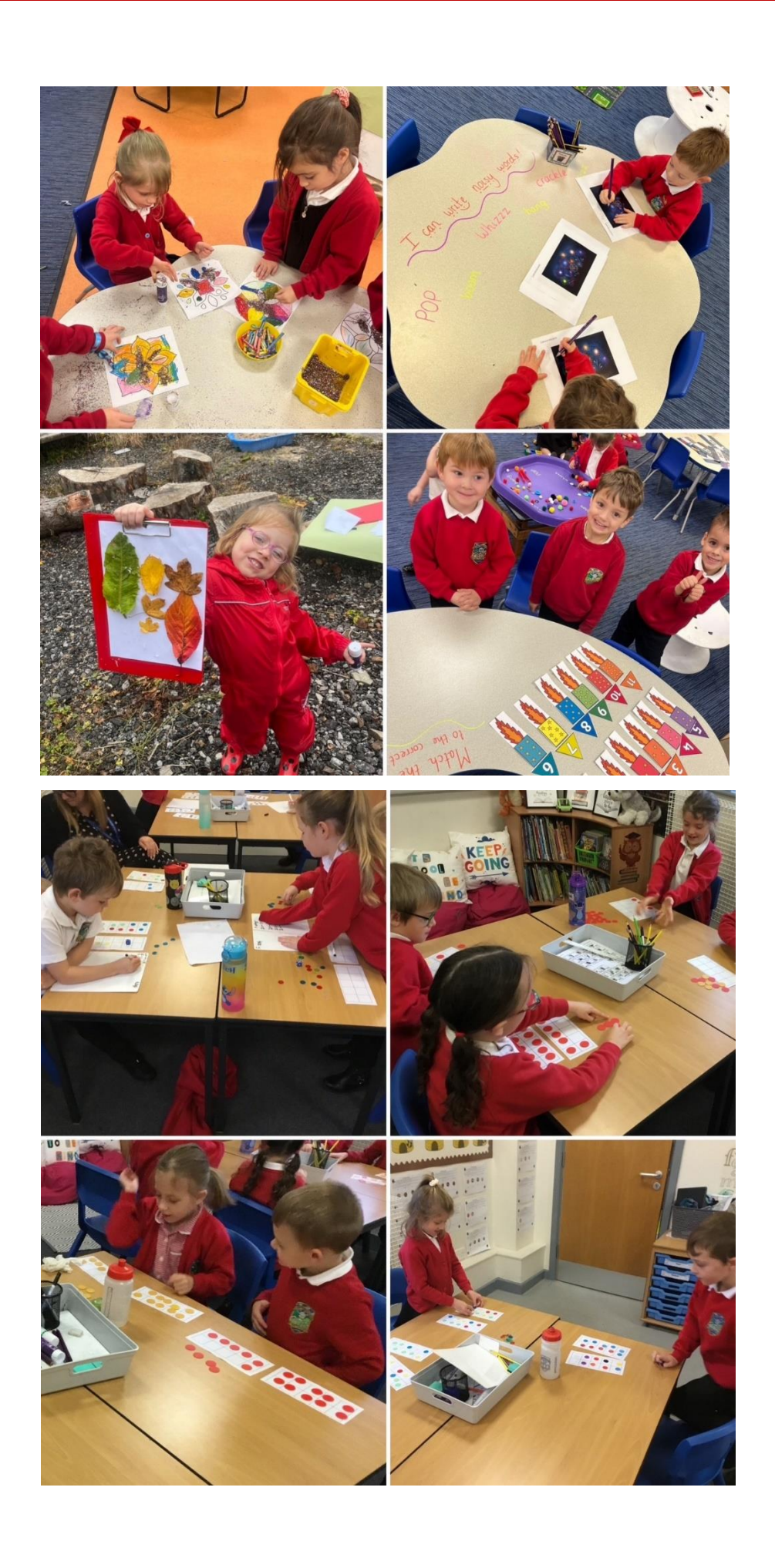
Follow us on Facebook at The Calder Learning Trust