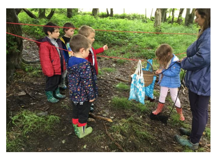
Follow us on twitter @CalderPrimary @cp_classR @cp_class1 @cp_class2 @cp_class3