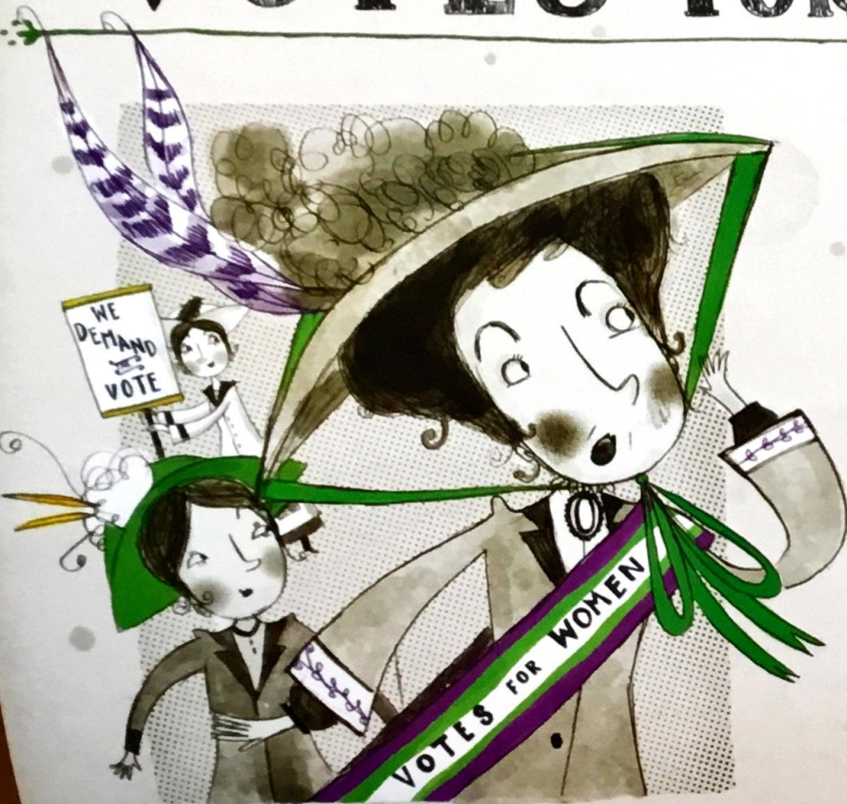
Emmeline Pankhurst giving a rousing speech to onlookers with her suffragette daughters, Christabel and Sylvia.

In England, in 1903 Emmeline Pankhurst set out to inspire women from all walks of life – rich and poor, young and old – to campaign for an end to the law that said women weren't allowed to vote. These women became known as the suffragettes.